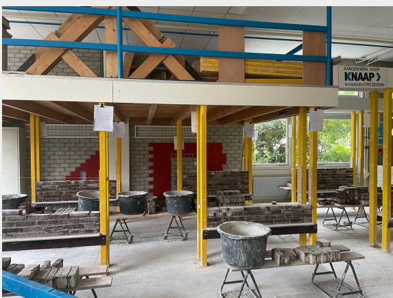
Training ground for future masons at Driestar College.