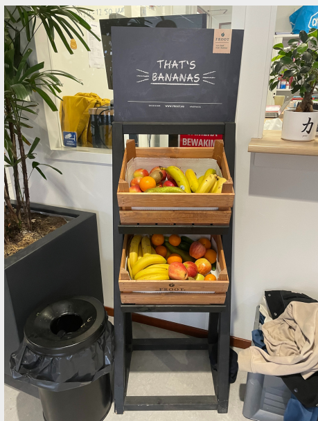
Fruit rack for students at Academie Tien.