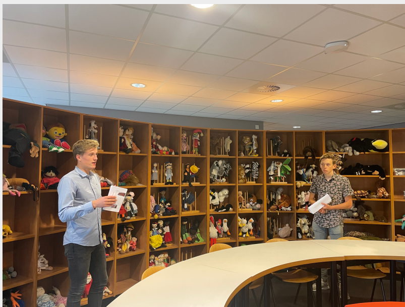
Driestar Christian University. A shelf of teaching aids (puppets!) and our guides.